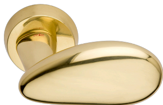
Ottone lucido - Polished brass Messing poliert - Laiton poli