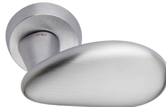
Cromo satinato - Satin chrome Mat chrome - Chrom satiné