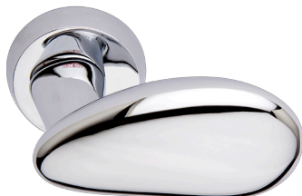
Cromo lucido - Polished chrome Glanz chrome - Chrom poli